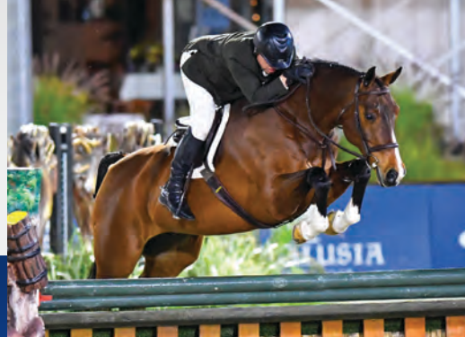
HIGH DESERT SPORT PHOTO