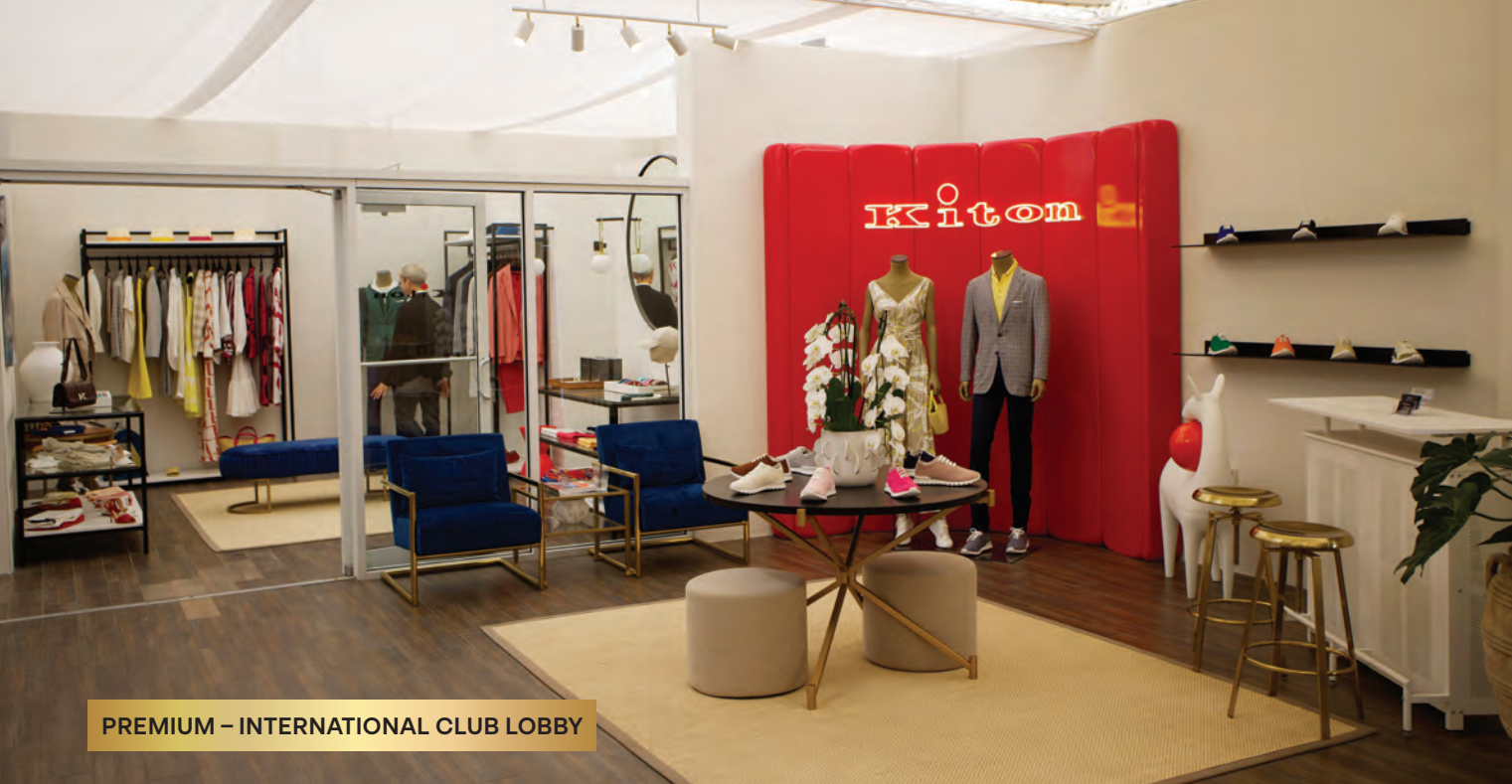
PREMIUM – INTERNATIONAL CLUB LOBBY