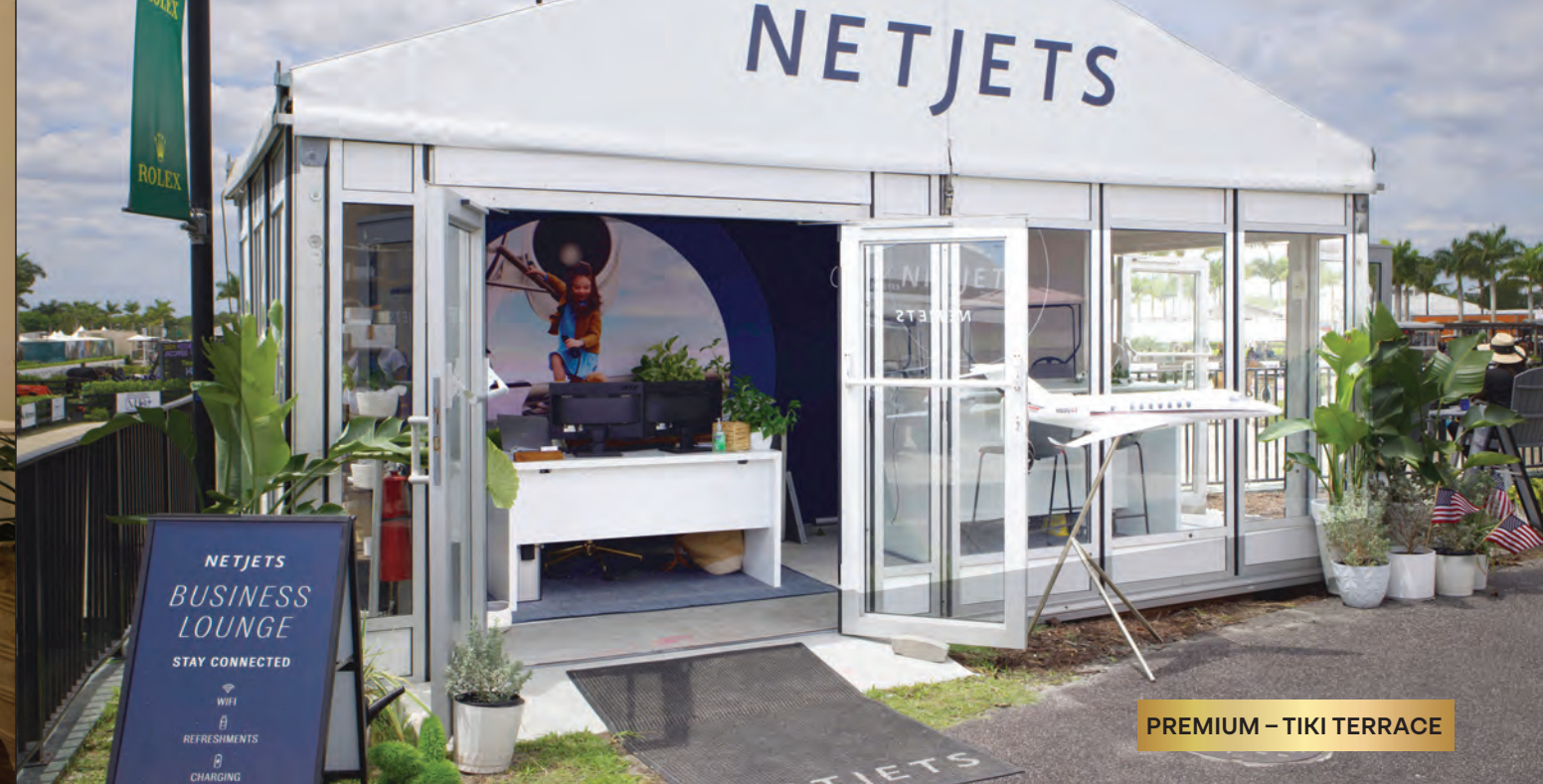
PREMIUM – TIKI TERRACE