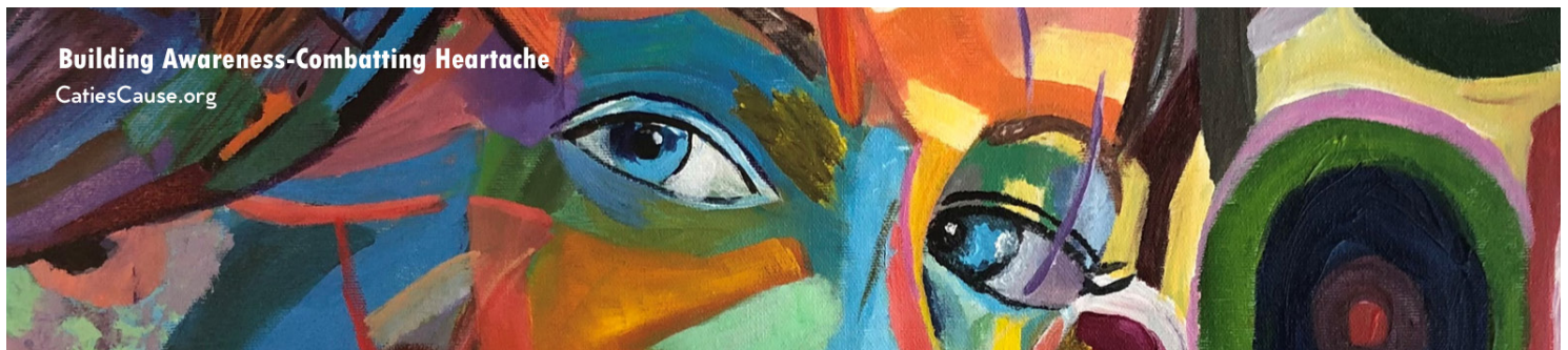
Building Awareness-Combatting Heartache CatiesCause.org